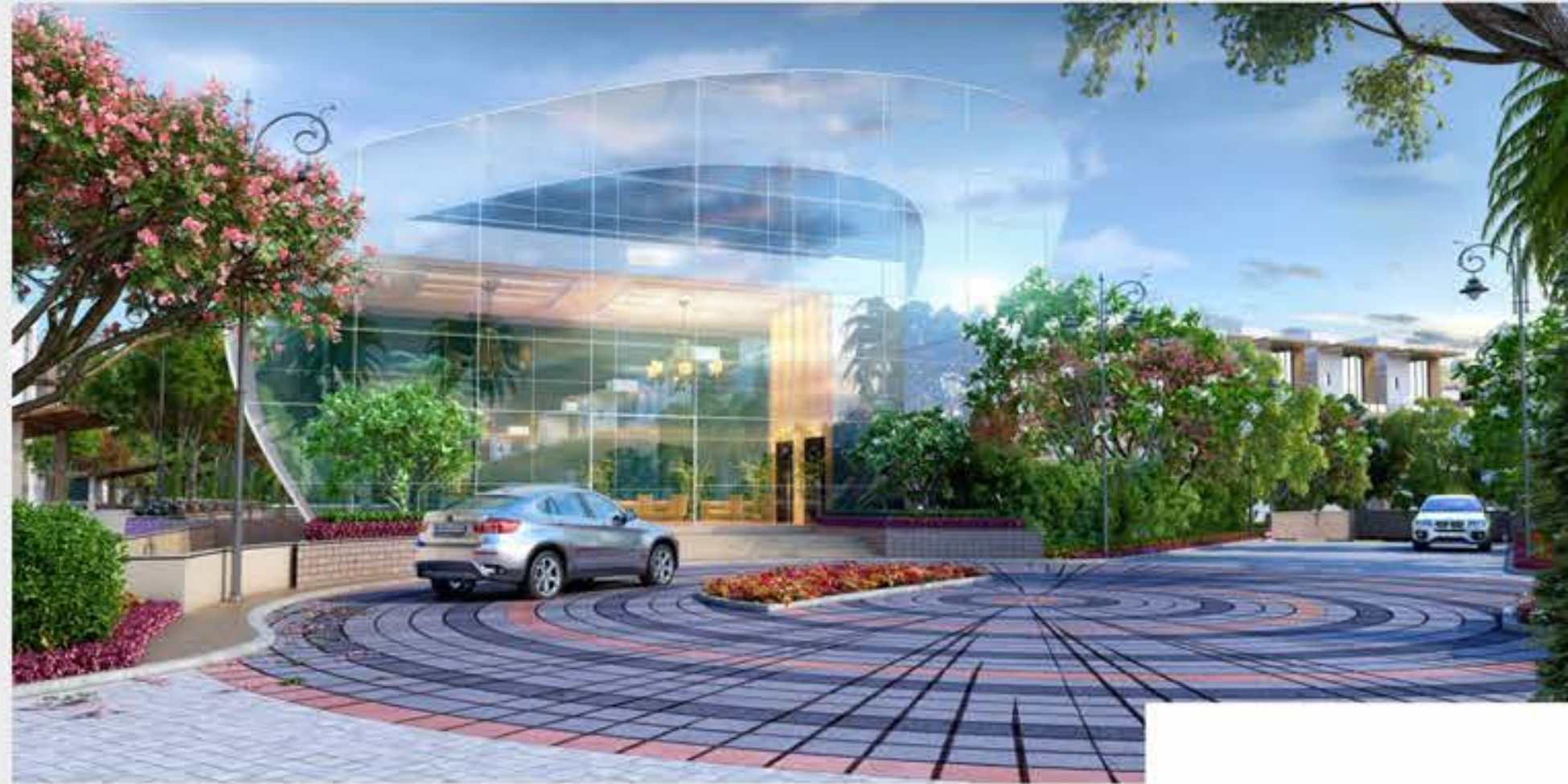
artistic views of the Club premises

Why should the luxury be limited to the confines of your villa walls? When you opt for a piece of this premium project, you are definitely not just buying a villa but a lot more.