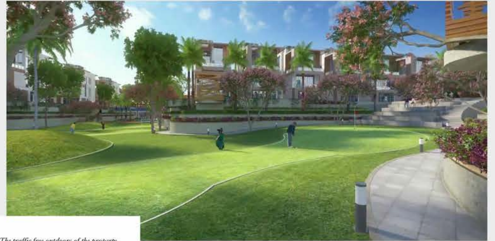
artistic views of the putting greens

Practice that swing to perfection. Or simply amble around to soak in the serenity. Whatever you choose, it's bound to lift your spirits. The ambience at Sun Twilight Villas is definitely a premium factor.