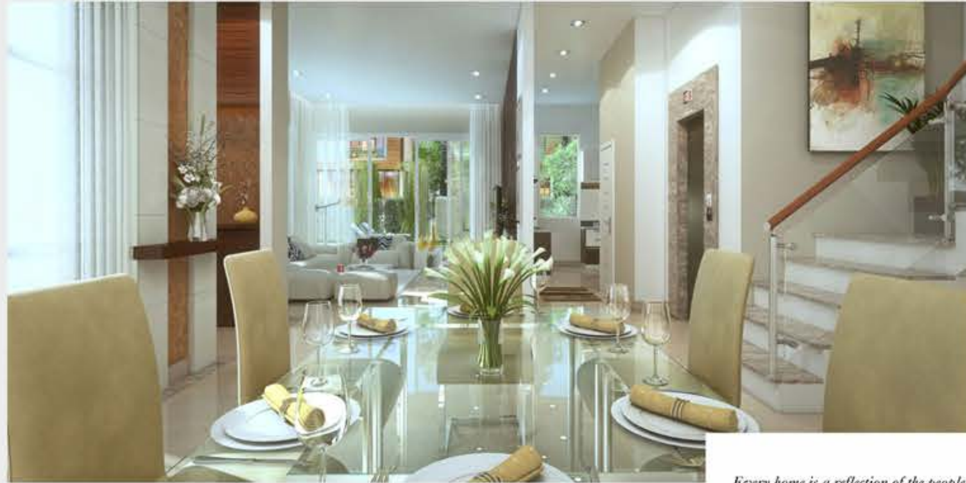
artistic views of the Villa interiors

Every home is a reflection of the people that inhabit it. It's a statement of their stature. And when you inhabit a premium property like the one here, the canvas for self expression knows no bounds.