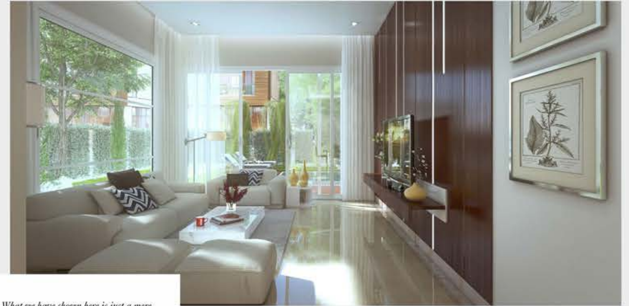
artistic views of the Villa interiors

Every home is a reflection of the people that inhabit it. It's a statement of their stature. And when you inhabit a premium property like the one here, the canvas for self expression knows no bounds.