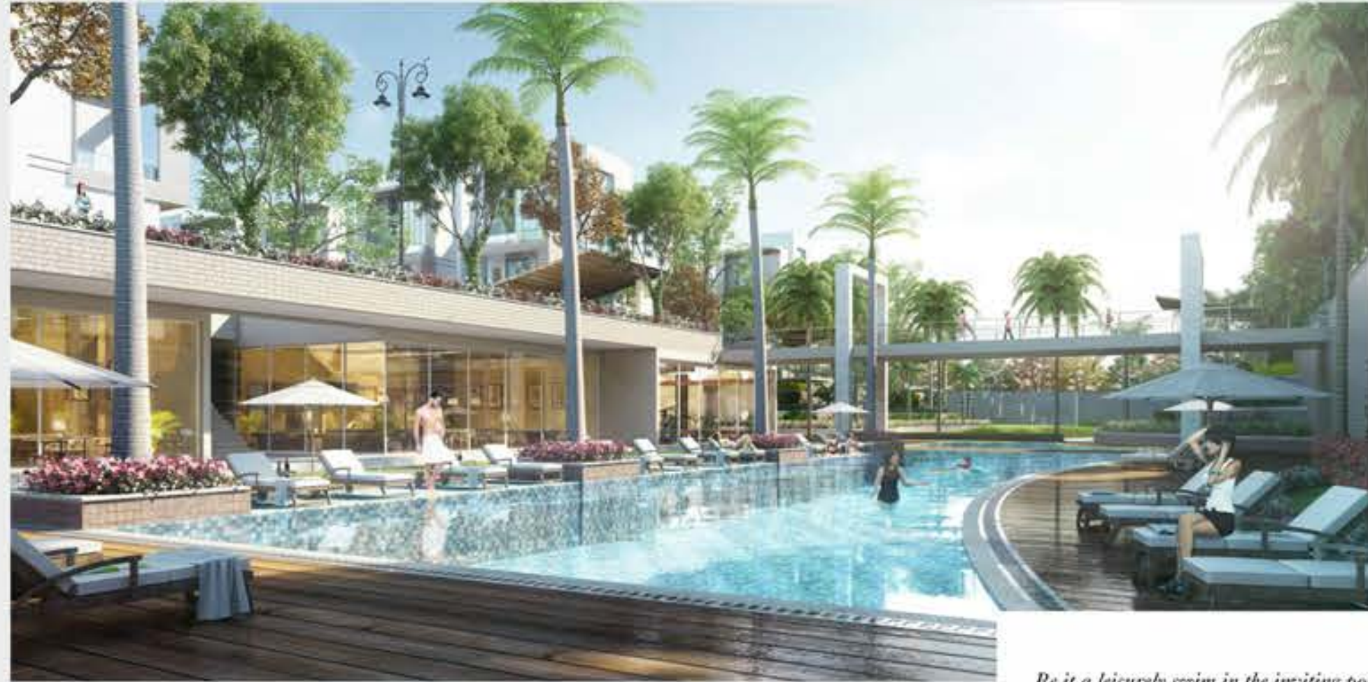
artistic views of the Club premises

Be it a leisurely swim in the inviting pool on a warm evening or a matter of habit for the avid swimmer, your needs will be met. Interacting with your neighbours or friends from outside the premises, this Club acts as a perfect point.