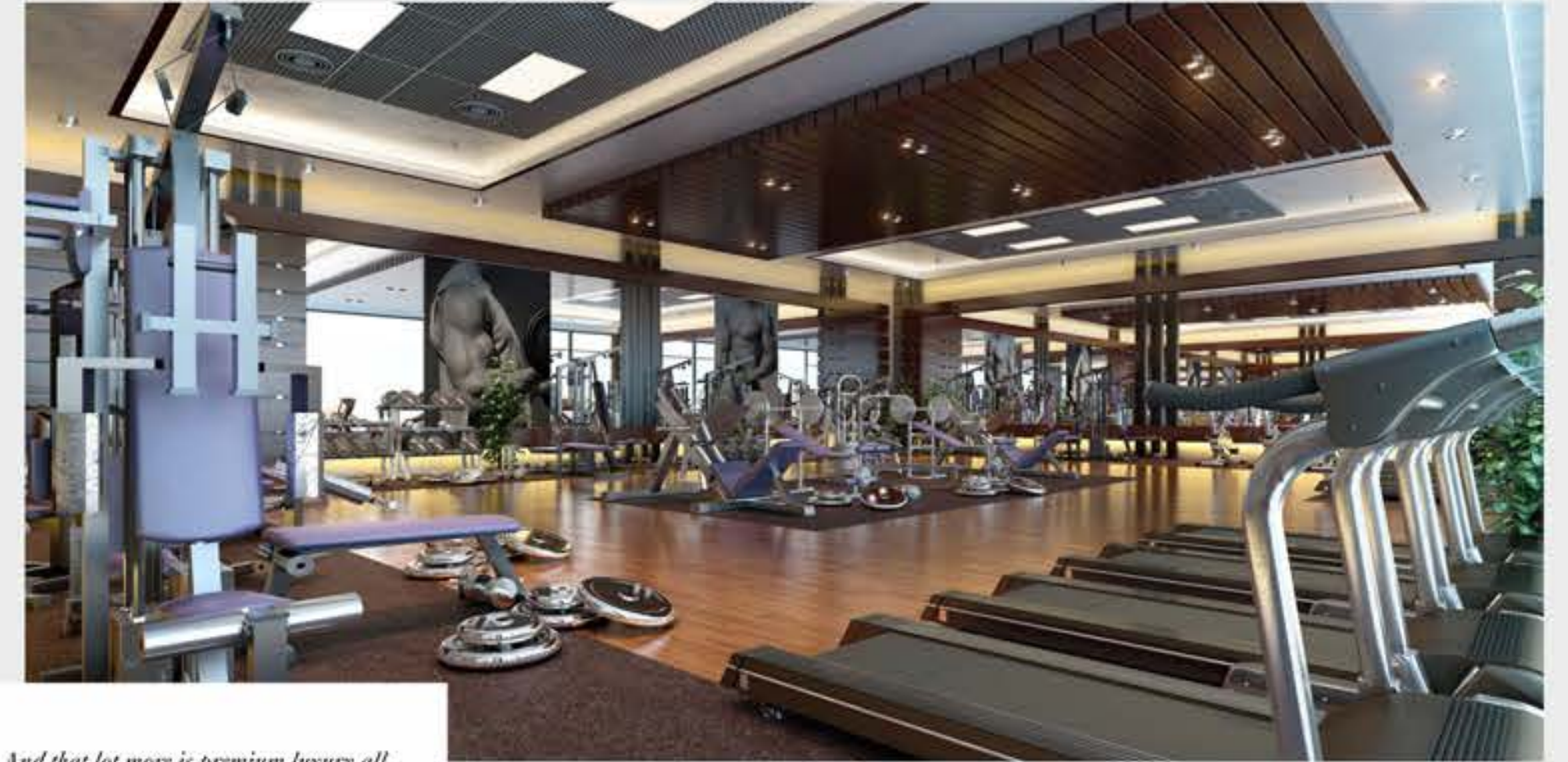
artistic views of the Club premises

Why should the luxury be limited to the confines of your villa walls? When you opt for a piece of this premium project, you are definitely not just buying a villa but a lot more.