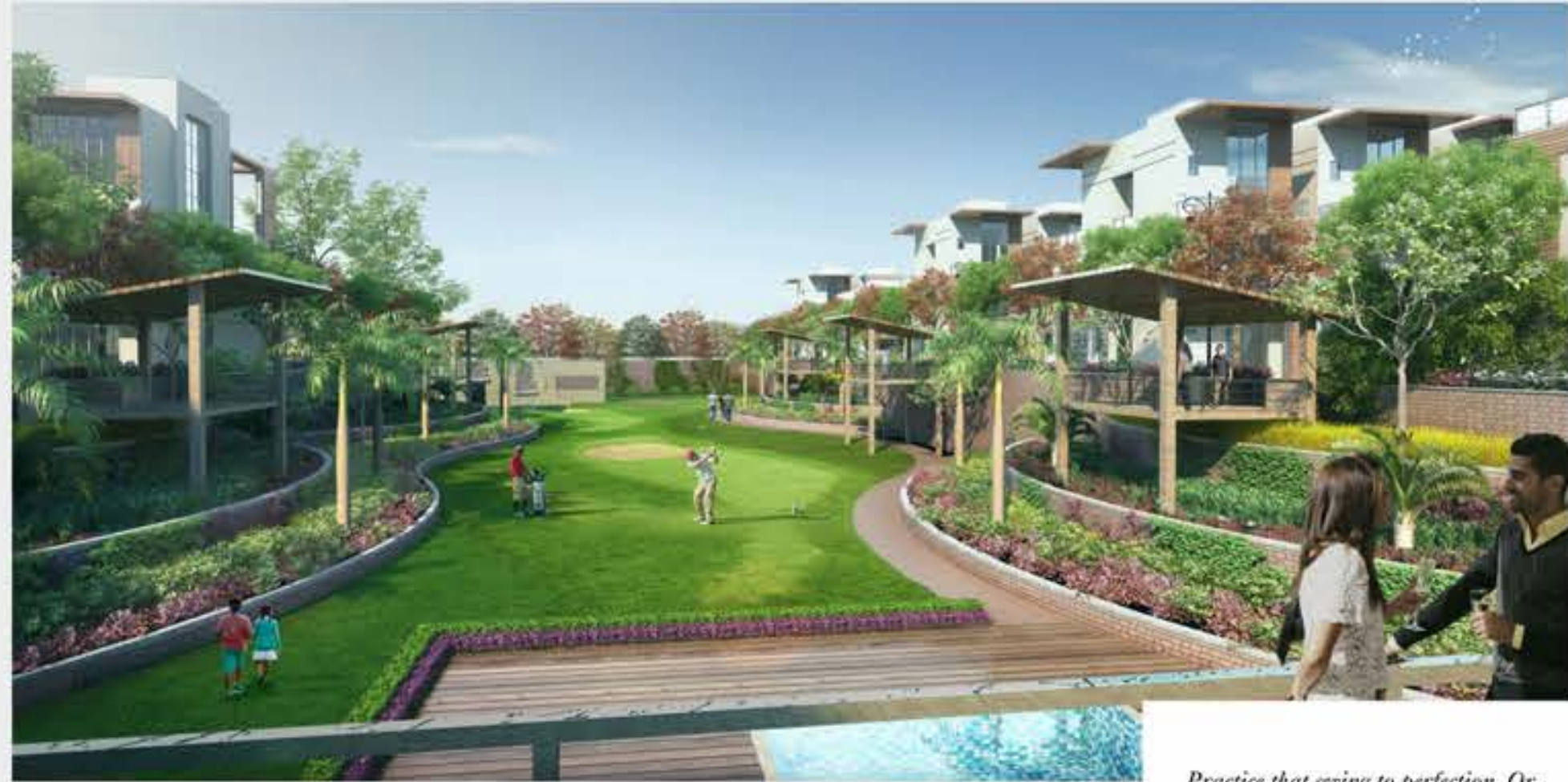
artistic views of the putting greens

Practice that swing to perfection. Or simply amble around to soak in the serenity. Whatever you choose, it's bound to lift your spirits. The ambience at Sun Twilight Villas is definitely a premium factor.