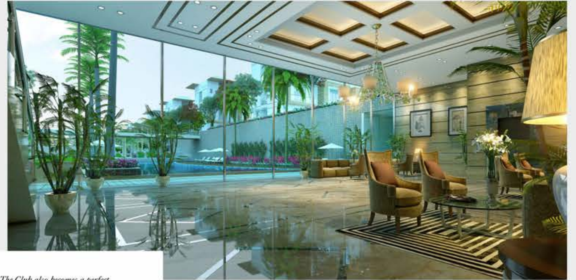
artistic views of the Club premises

Be it a leisurely swim in the inviting pool on a warm evening or a matter of habit for the avid swimmer, your needs will be met. Interacting with your neighbours or friends from outside the premises, this Club acts as a perfect point.